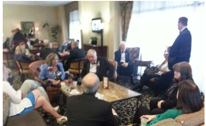
Spouses of Candidates enjoy an afternoon Tea during the Exemplification. Knights and spouses enjoy enjoyed the reception before dinner.

Council 13671 Have Eight of Our Twelve New 4 th Degree Members are shown in the Second Row. The Sir Knights Are Waiting With Approximately 145 Candidates. The Exemplification, Mass, Reception and Dinner Was Worth the Time and Effort.